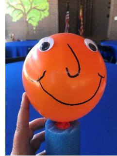
Figure 4a and 4b