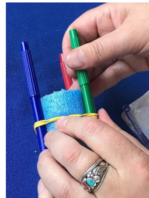
Figure 5a and 5b