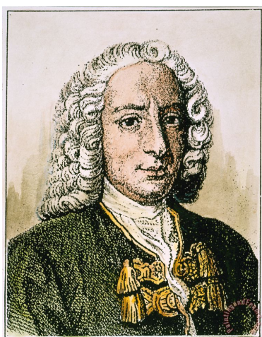
Daniel Bernoulli 1700-1782